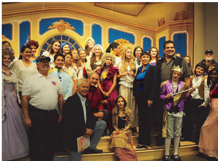
The cast pictured with Vietnam Veteran special guests and fundraiser contributors

Our dearest Fairy Godmother sure was right when she said impossible things are happening every day. It seems virtually impossible that the cast of Cinderella pulled off this fantastic of a show in only five weeks! As we